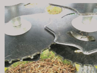
Cutting blades and notched discs for clean cuts and trellis post protection