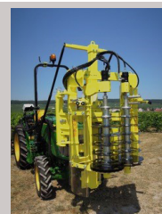
Prepruner in travel position